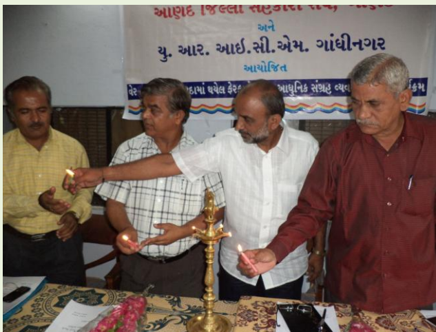
Training and awareness programme for farmers at Anand.