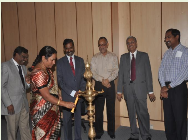
Inauguration of training programme for warehouse managers at Hyderabad on the 25 th June, 2012